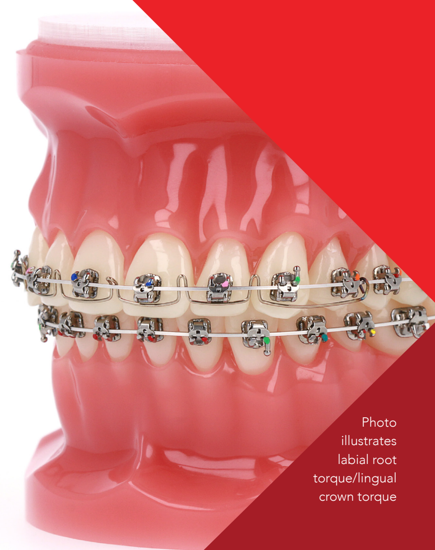
Photo illustrates labial root torque/lingual crown torque